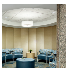
Perfect for office, education, and healthcare spaces

CAD/Revit® drawings at: armstrongceilings.com/cadrevit