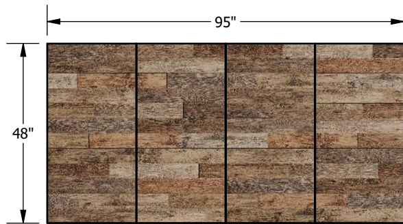
2x4' Rustic Plank Pattern Size