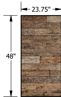
5334W2L04T10XPC 2x4' Rustic Plank Panel C