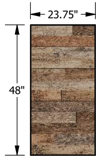
5334W2L04T10XPD 2x4' Rustic Plank Panel D