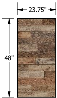
5334W2L04T10XPB 2x4' Rustic Plank Panel B